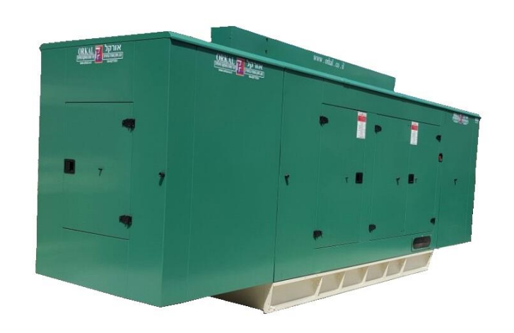
For illustration only